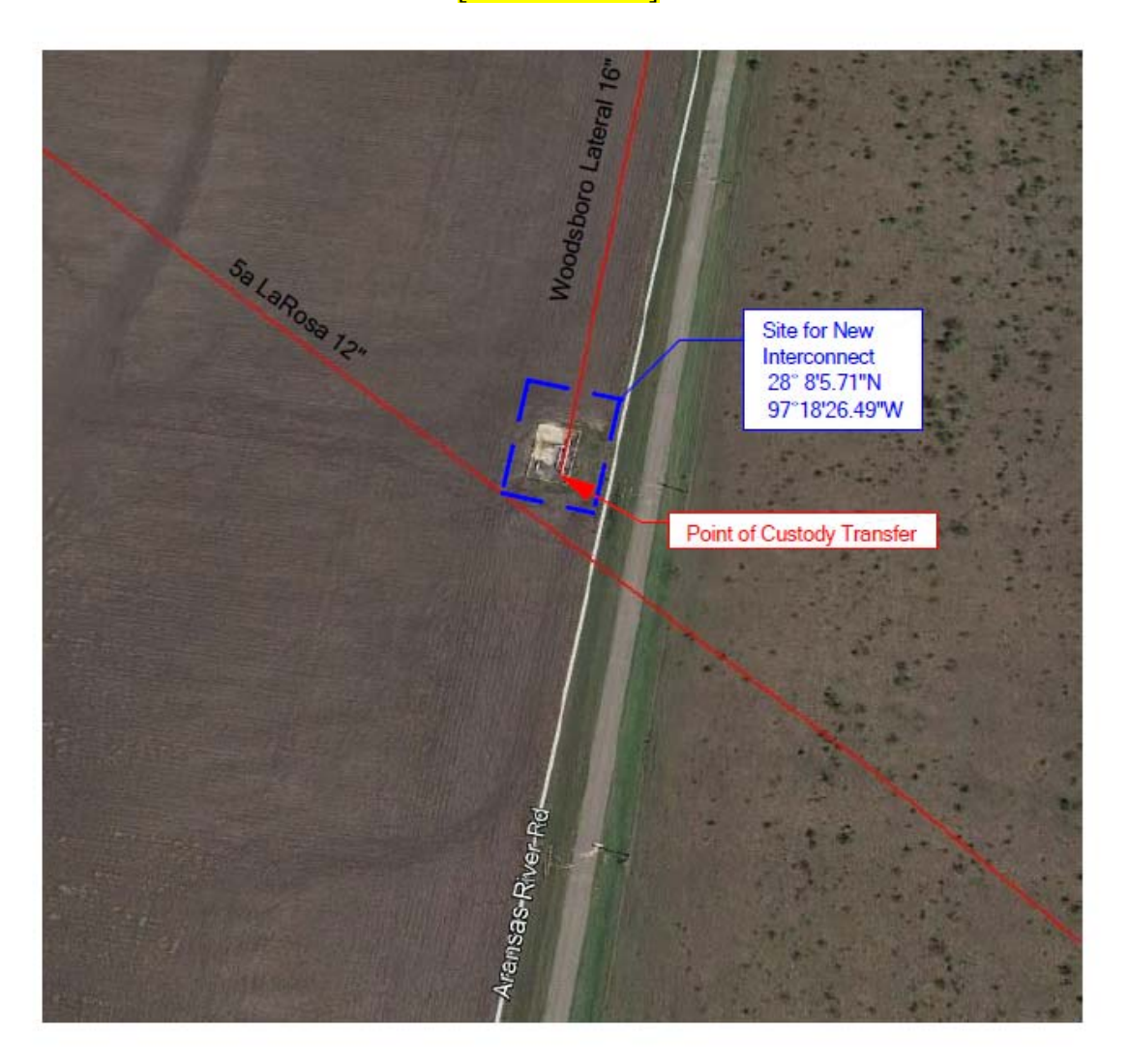
EXHIBIT "D" TO INTRASTATE FIRM GAS TRANSPORTATION AGREEMENT DATED [DATE] BETWEEN KM AFFILIATE TBD AND [ENTITY TBD]